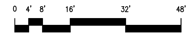
1 OVERALL PLAN - LEVEL 16 1/16"=1'-0"